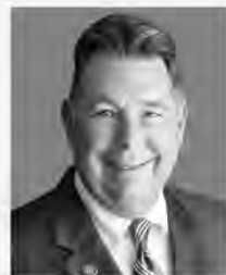
Hon. Clay M. Smith, Ret.

View their profiles at WWW.JUDICATEWEST.COM or call (800) 488-8805 to schedule a case.