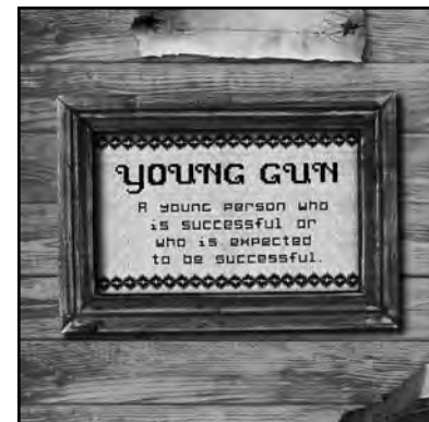
Young Guns, 8