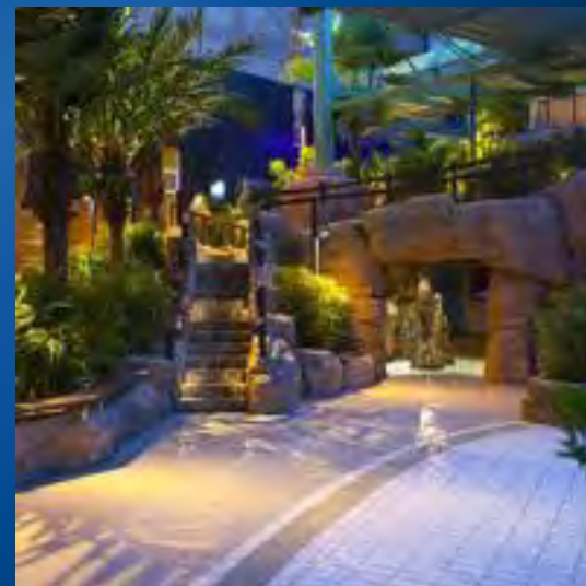
Scandic The Reef