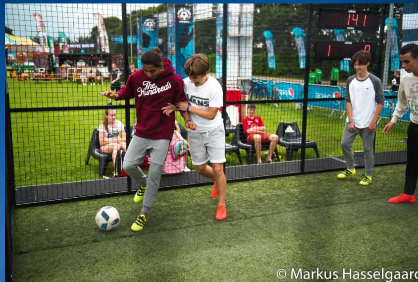
Dana Cup Event Area