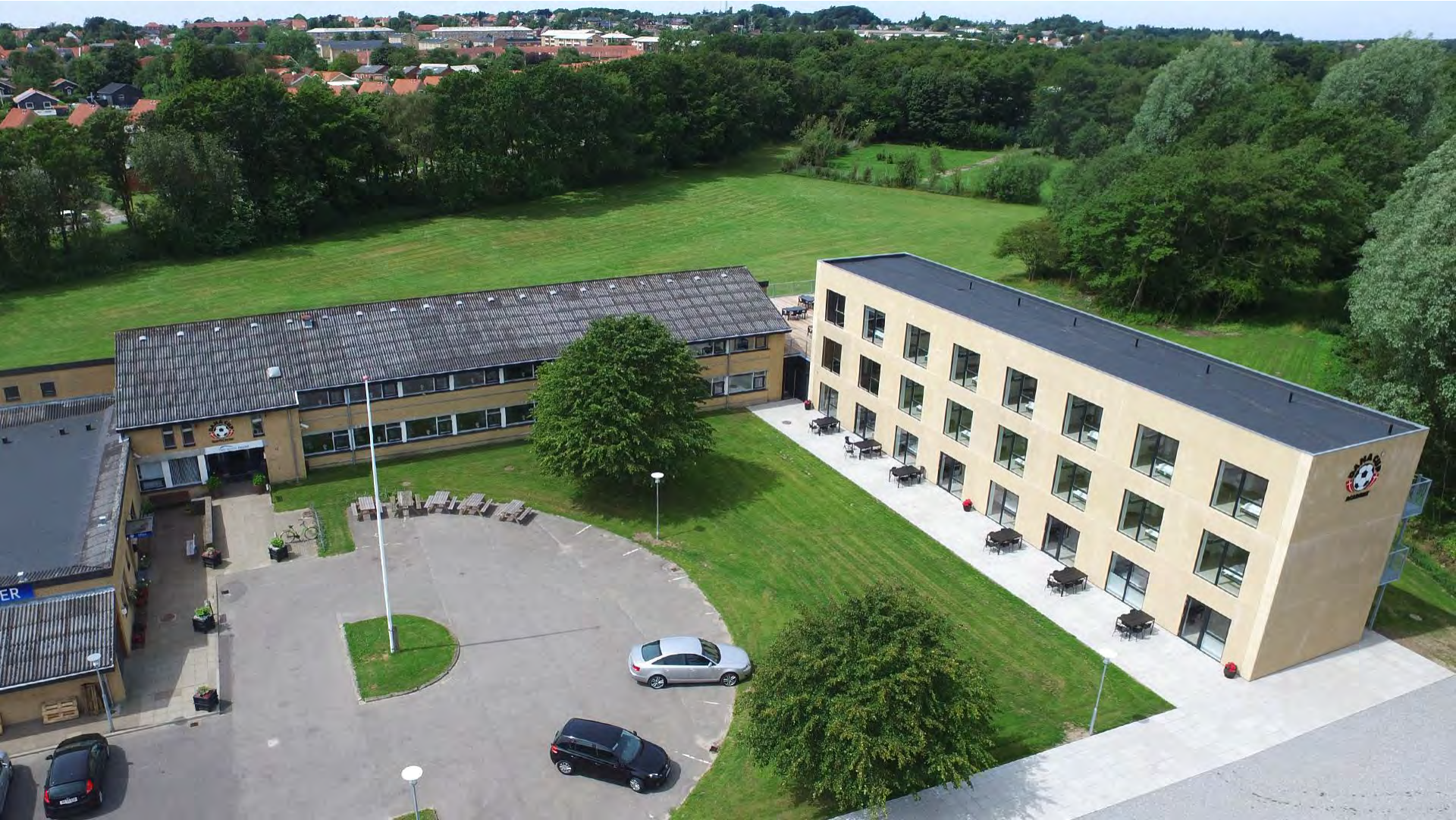
Dana Cup Sports Center and Dana Cup Academy