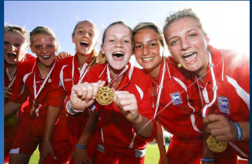
Ipswich Town - England