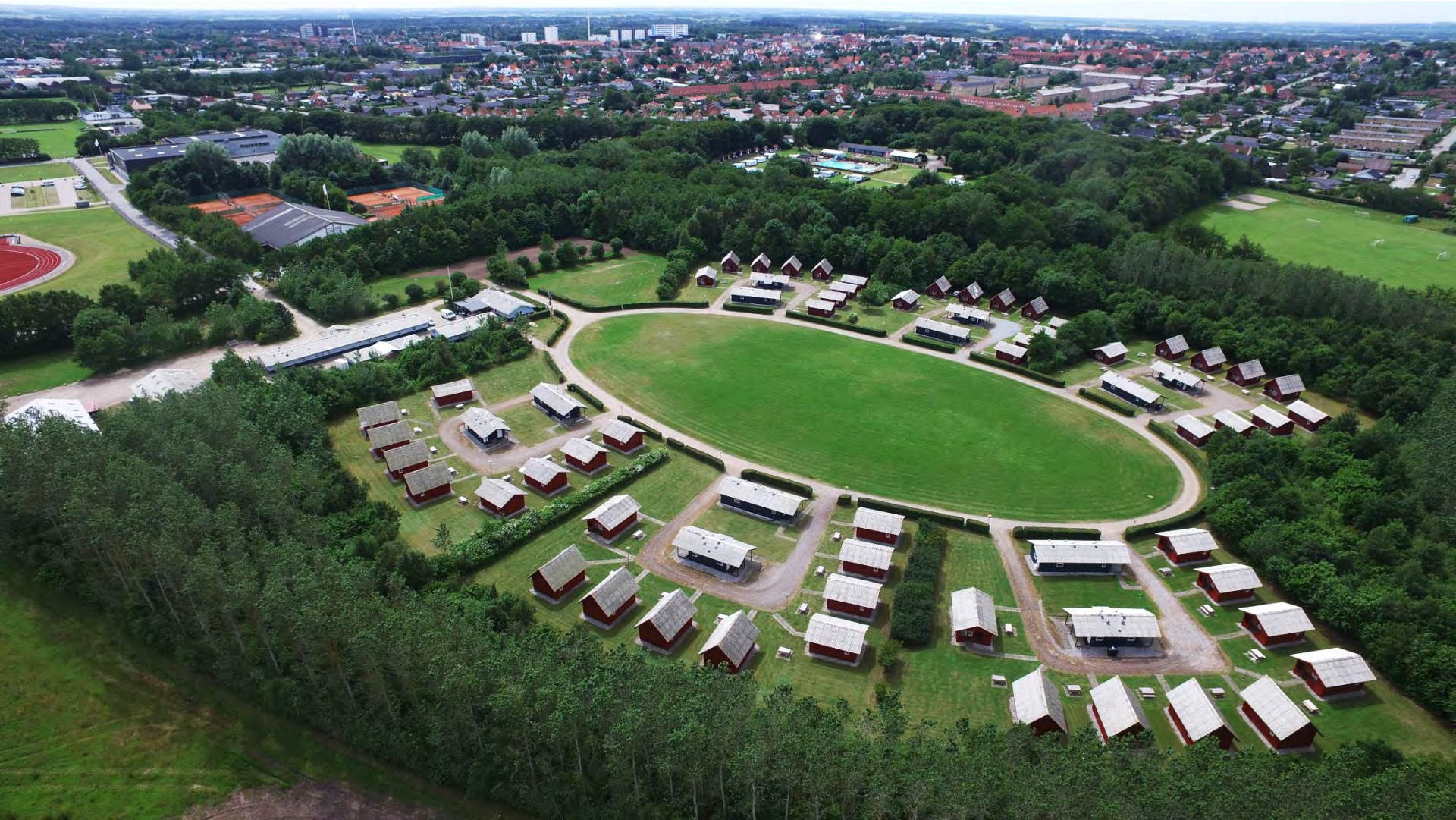
Dana Cup Town