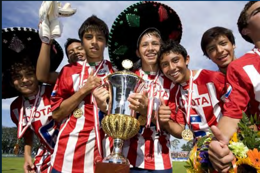
Chivas - Mexico