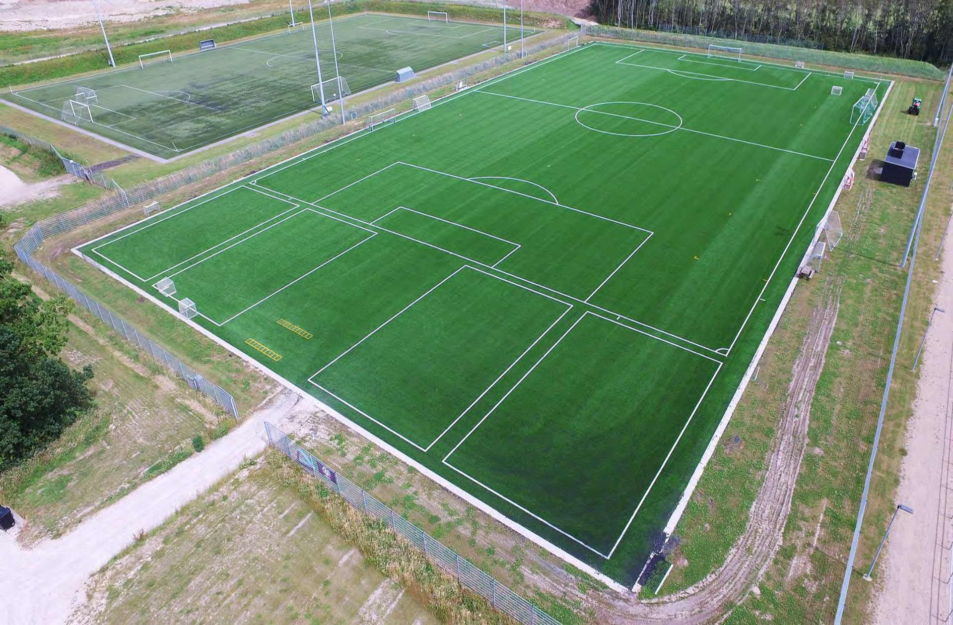
Artificial playing fields